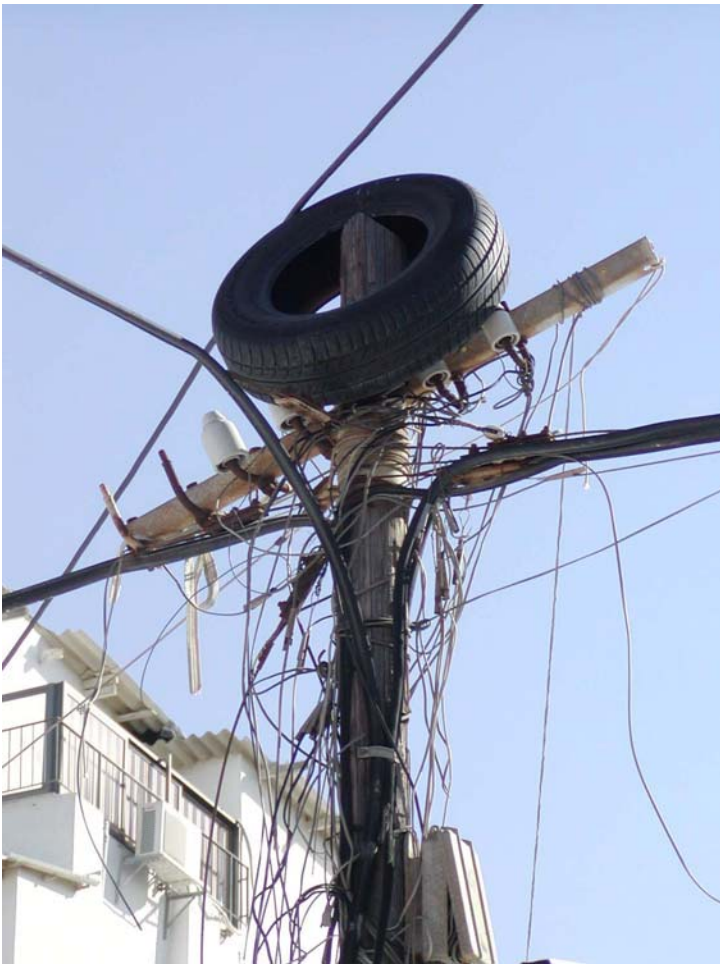
What does your antenna system look like? (this is from Jerusalem, Israel)