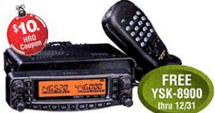
FT-8800R 2M/440 Mobile