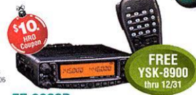
FT-8900R Quadband Transceiver