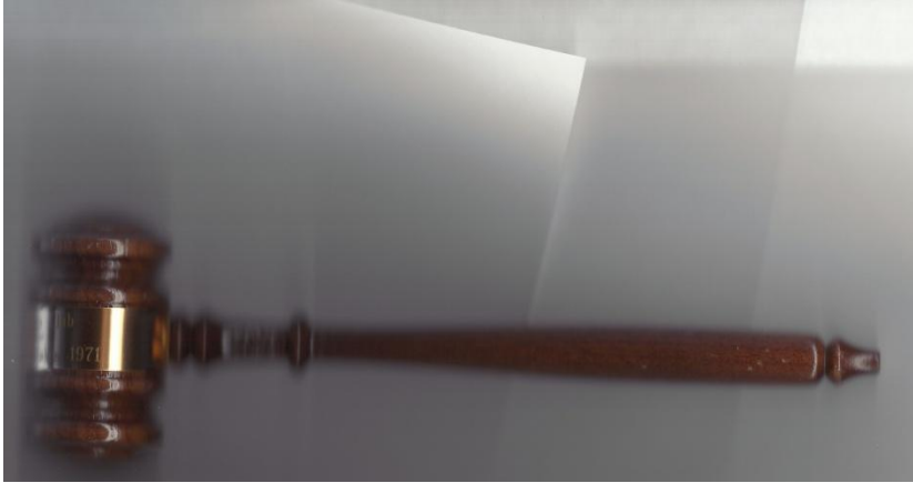
The “Asterisk Gavel”