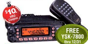
FT-7800R 2M/440 Mobile