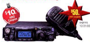
FT-817ND HF/UHF/HT TCVR