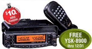
FT-8800R 2M/440 Mobile